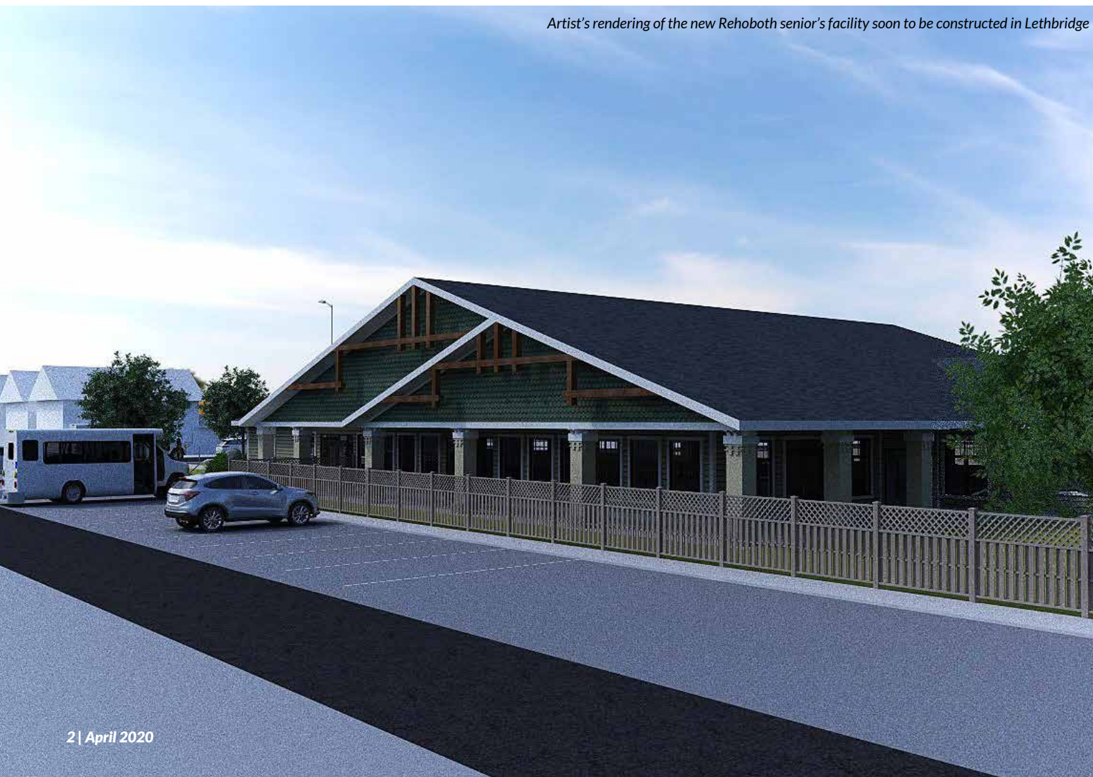
Artist's rendering of the new Rehoboth senior's facility soon to be constructed in Lethbridge