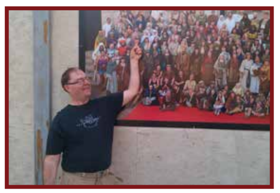
The 2017 Cast & Crew