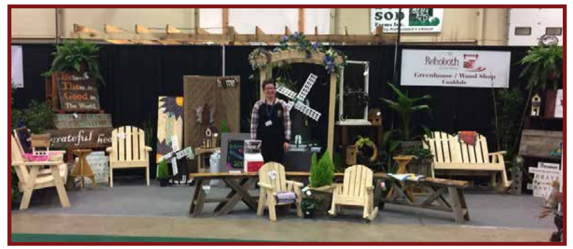
Set up at the Home & Garden Trade Show

Every year In March, we set up a booth at the Home & Garden Trade Show in Lethbridge. This is always our kick off for the spring season. It's a great place to showcase the talents of our hard-working individuals and their staff with their woodworking and seasonal crafts. If you missed seeing us there, please stop by our Coaldale location!