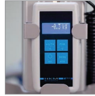
Digital patient scale. (optional)