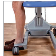
The carrier frame is made from high-quality steel and formed for self-entry.