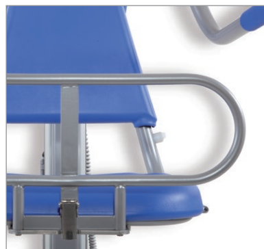
Side rail for increased safety plugs in easily and features safety lock.