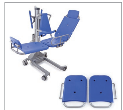
Two removable stretcher lift wings comfortably convert the seat lift into a full stretcher lift. The two modules are easily clicked into an existing safety adapter at the seat tray. Also available with a foot rest. (optional)