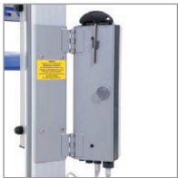
Easy battery access and removal.